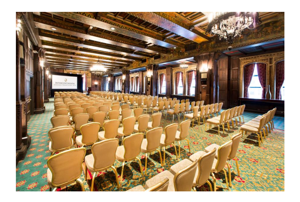
"With over 40,000 sq. ft. of meeting venues options, the InterContinental Chicago is the classic settings for historic meetings and event."

Meetings at InterContinental Chicago Hotel are always timeless. Our wide array of venues allow you to host both large conferences and smaller breakouts.